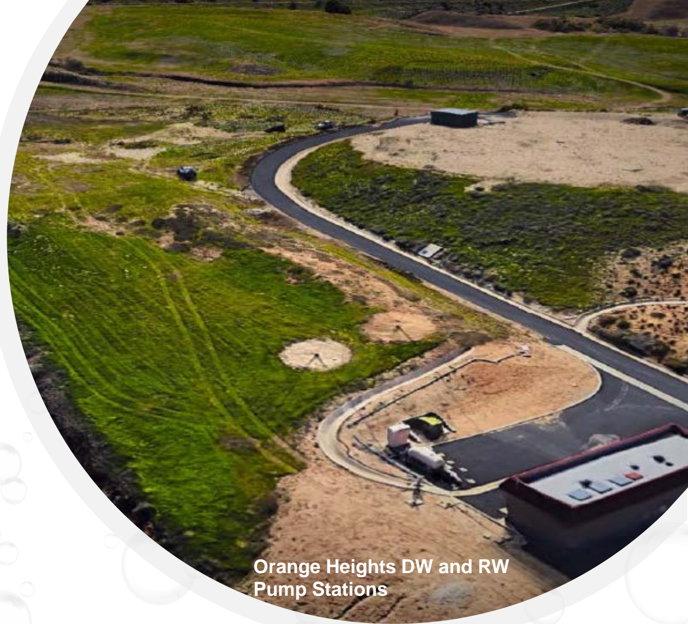
Orange Heights DW and RW Pump Stations