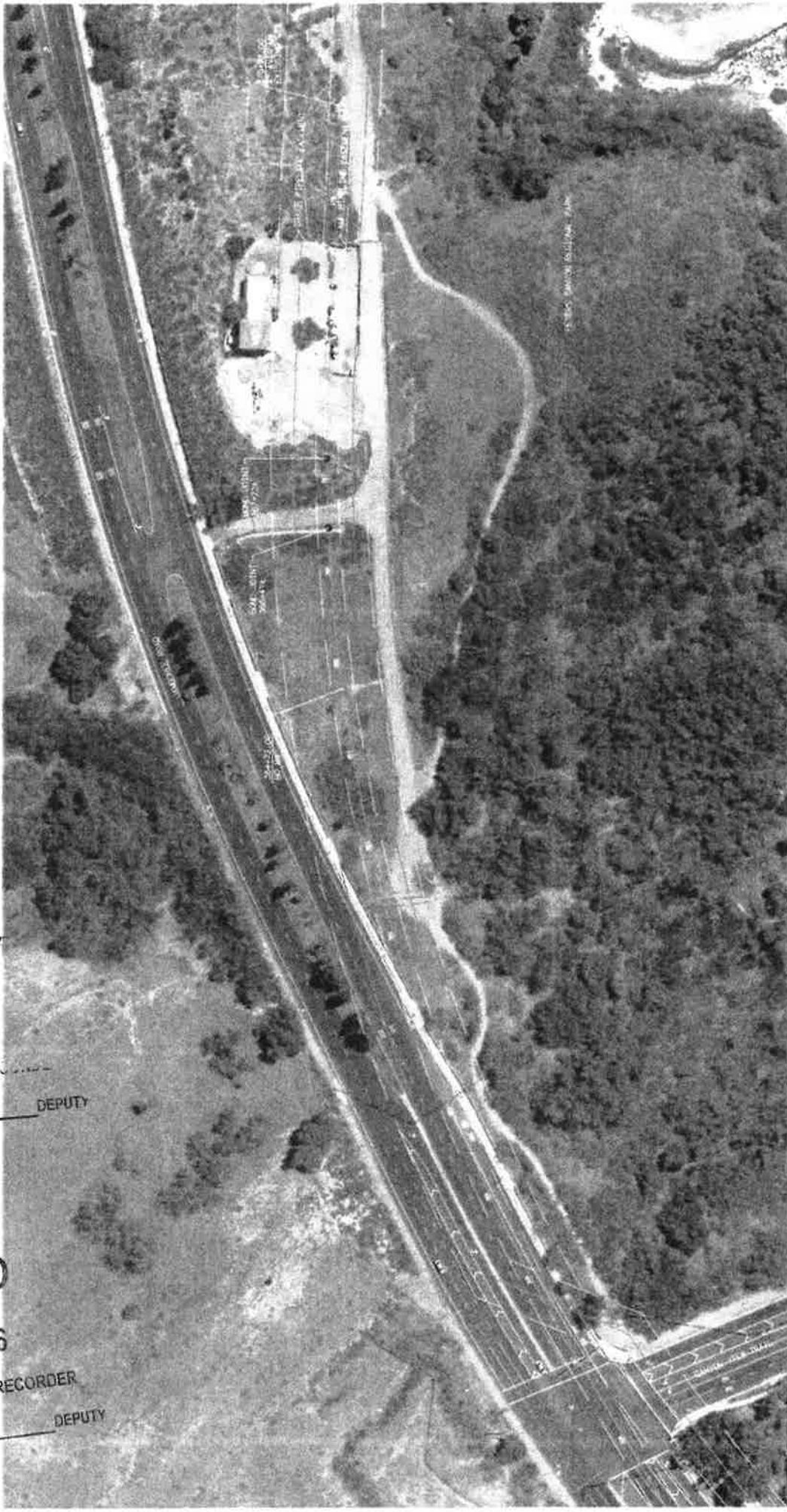
Exhibit "A" - Peter's Canyon Site