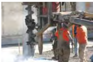
Pile driving for membrane bioreactor.