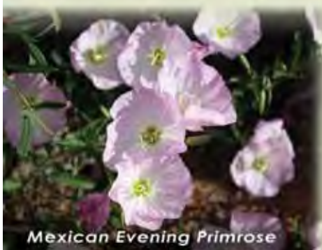
Mexican Evening Primrose

For more information, and to RSVP, go to www.irwd.com and click on "Free Programs" and "Landscape Workshops" or call 949-453-5327.