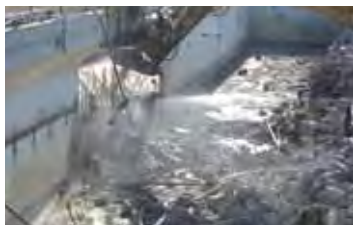
Demolition of aerobic digester tank.

The result will be high-quality recycled water that can be disinfected without further treatment for reuse.