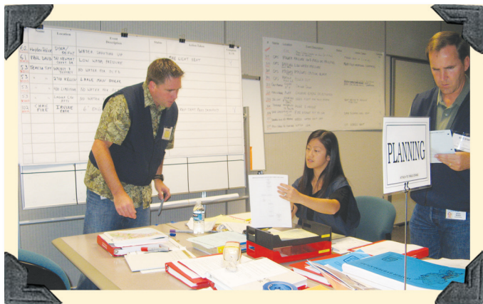
IRWD employees take part in a preparedness drill at the Emergency Operations Center.

For local breaking emergency news or special alerts, visit our Twitter Channel @IRWDemergency . Or join us on Facebook at: Irvine Ranch Water District.