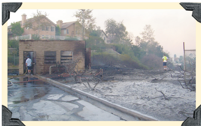
This IRWD Zone 8-9 pump house was gutted by the 2007 Santiago fire, so crews manually adjusted depths to the nearby reservoir.