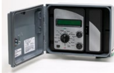
Smart Timers are available in many makes and models.

IRWD is currently offering a weather-based irrigation controller rebate of up to $425 per controller for homeowners. Visit www.alwayswatersmart.com and click on Rebates for details. Rebate amounts may fluctuate and are subject to funding availability.