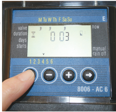
This controller has just been scheduled to water for three minutes, three days per week.

Be sure to check out Step 2 in next month's Pipelines .