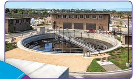
Michelson Water Recycling Plant, Irvine

Sewage is treated at the Michelson Water Recycling Plant in Irvine and converted into recycled water for use in many of the area's green spaces, as well as several local dual-plumbed buildings and manufacturing businesses.