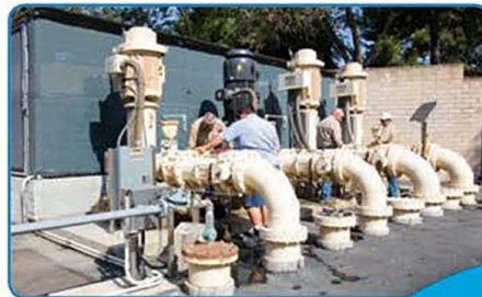
Groundwater Pumping Station in Irvine

26 local wells pump groundwater from the Orange County Groundwater Basin, which underlies much of the IRWD service area.