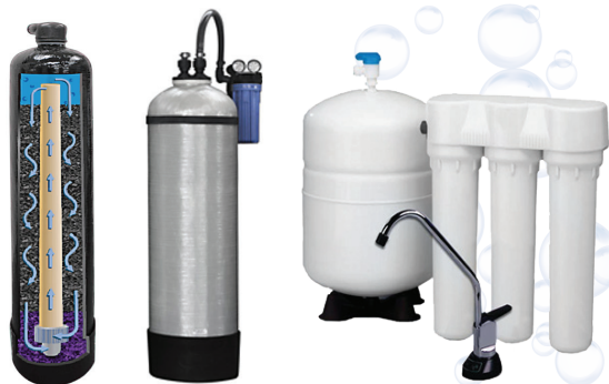
▲ Typical point-of-use and decentralized home water treatment devices. Left to right: water conditioner, exchangeable water softener, and reverse osmosis system

Homeowners have the option to install a point-of-use water-treatment device for all or specific areas of indoor plumbing. Centralized and decentralized water treatment systems may include: water softeners, water conditioners, reverse osmosis systems or multiple-stage filters. As water treatment system users, homeowners are responsible for the cost, maintenance, service, safety of their device, and the quality of the water the device produces.