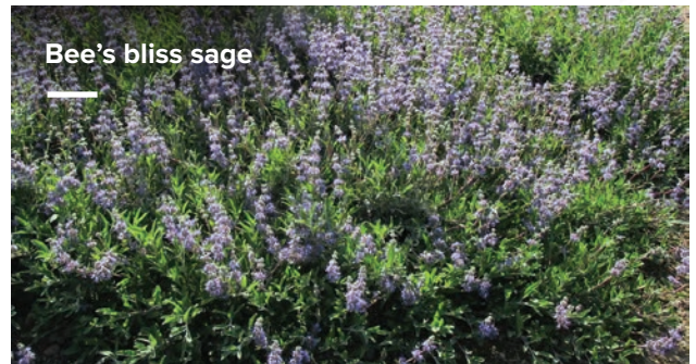
Bee's bliss sage

It's an important aspect to landscape design that we address in Episode 1 of IRWD's new video series, The Shed Show, so be sure to check it out. You can also search through a variety of plant options at our website, rightscaperesources.com/plants.php .