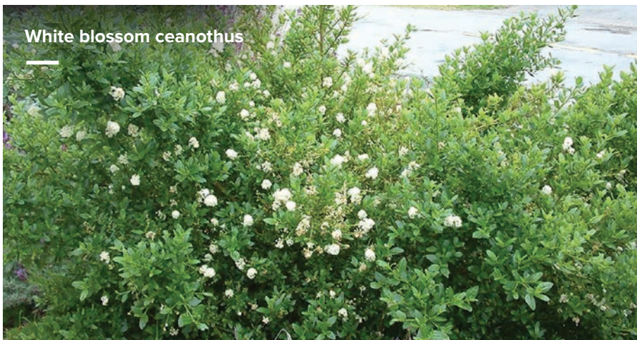
White blossom ceanothus